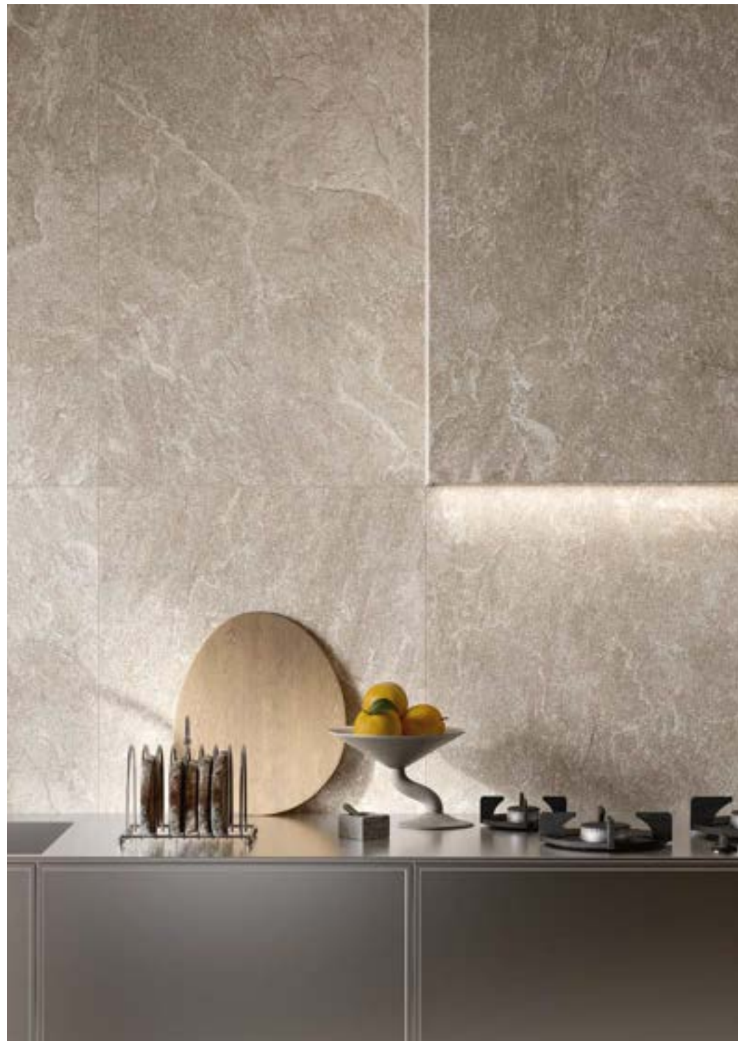
Collection: Solid Stone | Color: Solid Stone Beige