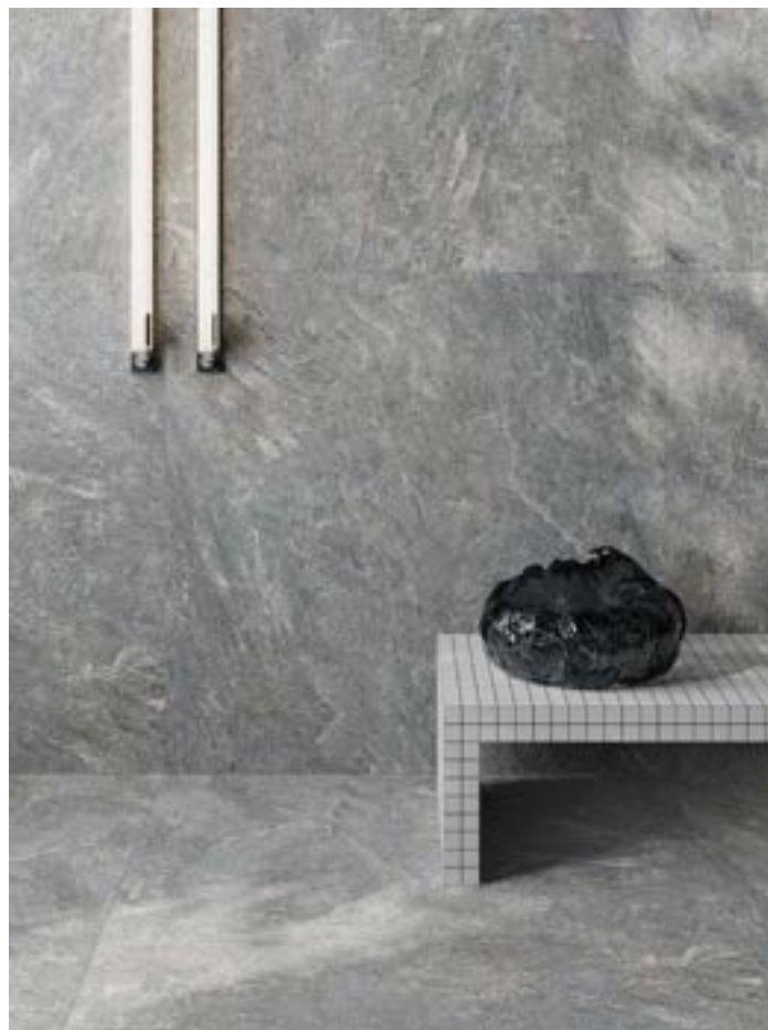
Collection: Solid Stone | Color: Solid Stone Anthracite

An elegantly curated palette of mineral colors enhances the natural beauty of individual spaces. From cooler, calming tones to warm, inviting hues, these shades reflect the rich variations of natural stone, adding depth and character to both interiors and exteriors.