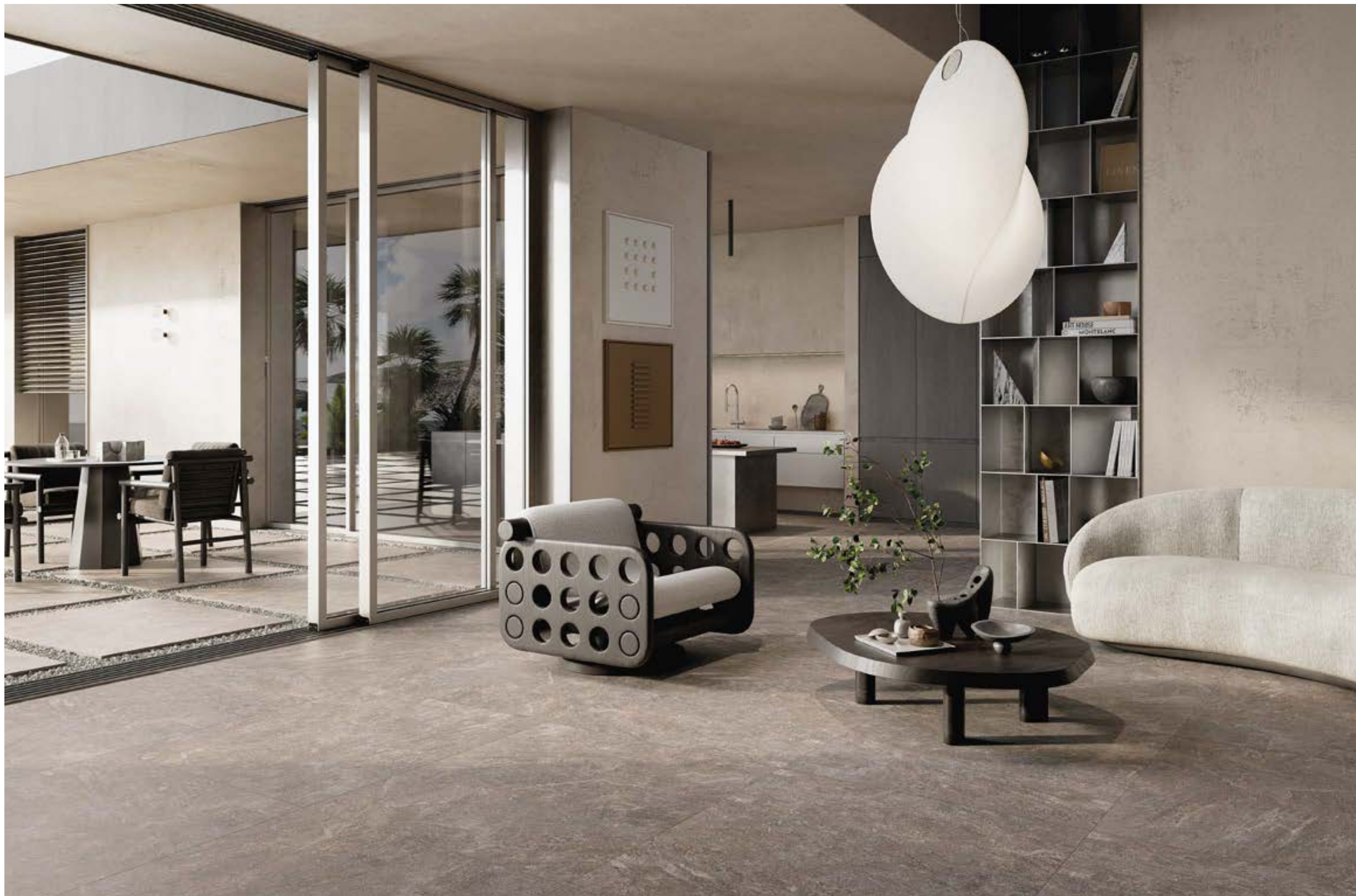
Collection: Solid Stone | Color: Solid Stone Brown