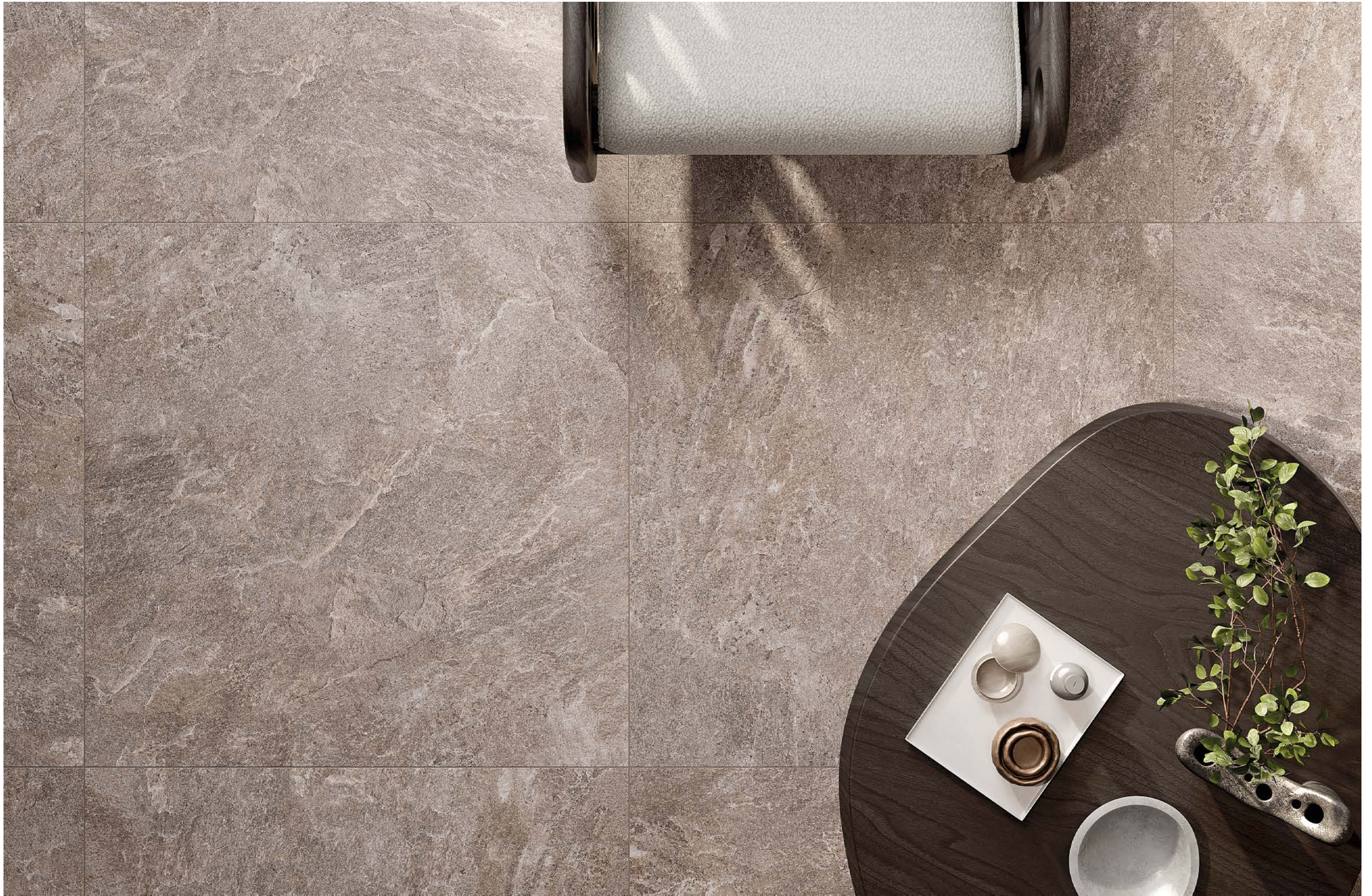
Collection: Solid Stone | Color: Solid Stone Brown