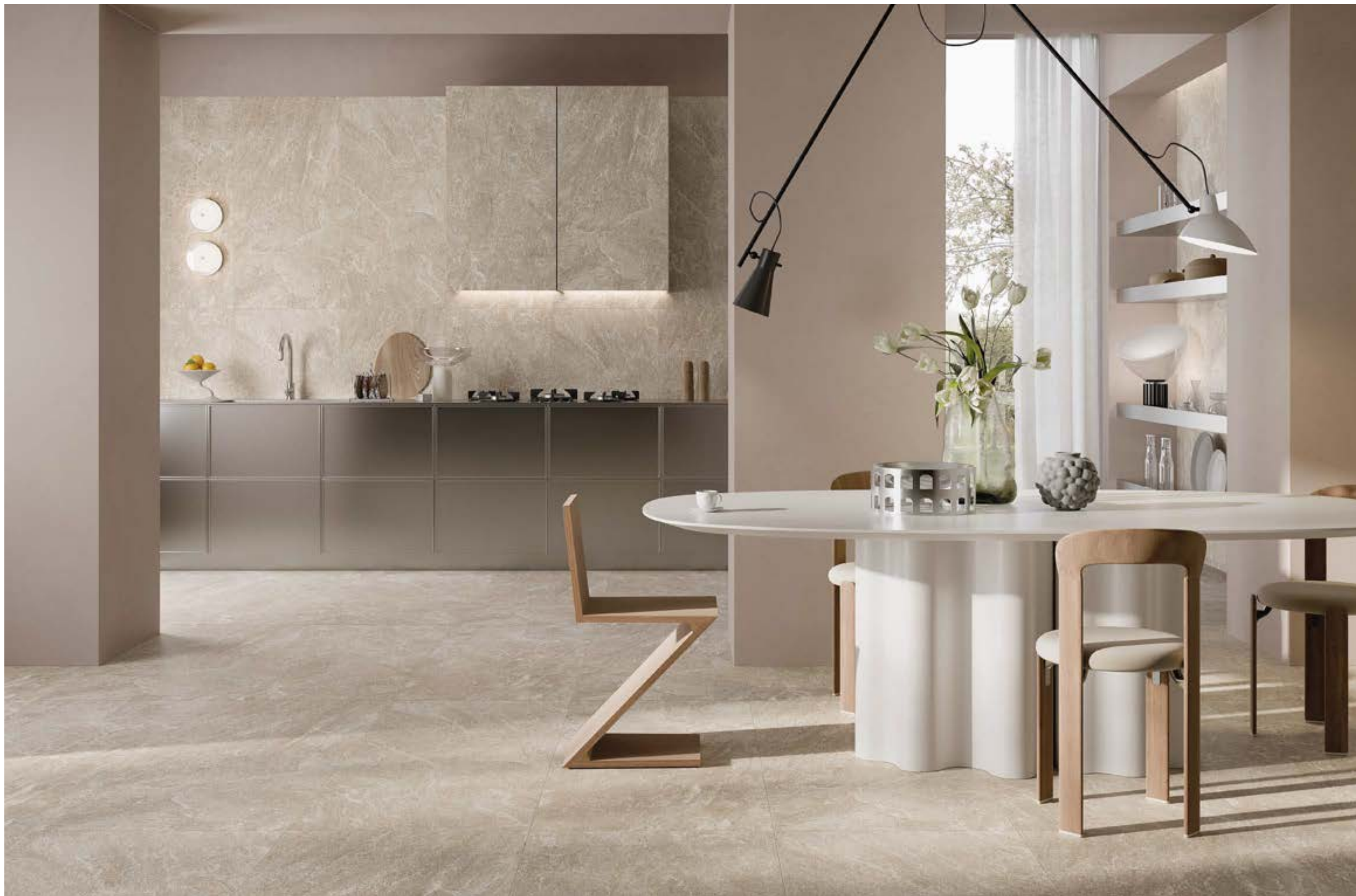
Collection: Solid Stone | Color: Solid Stone Beige