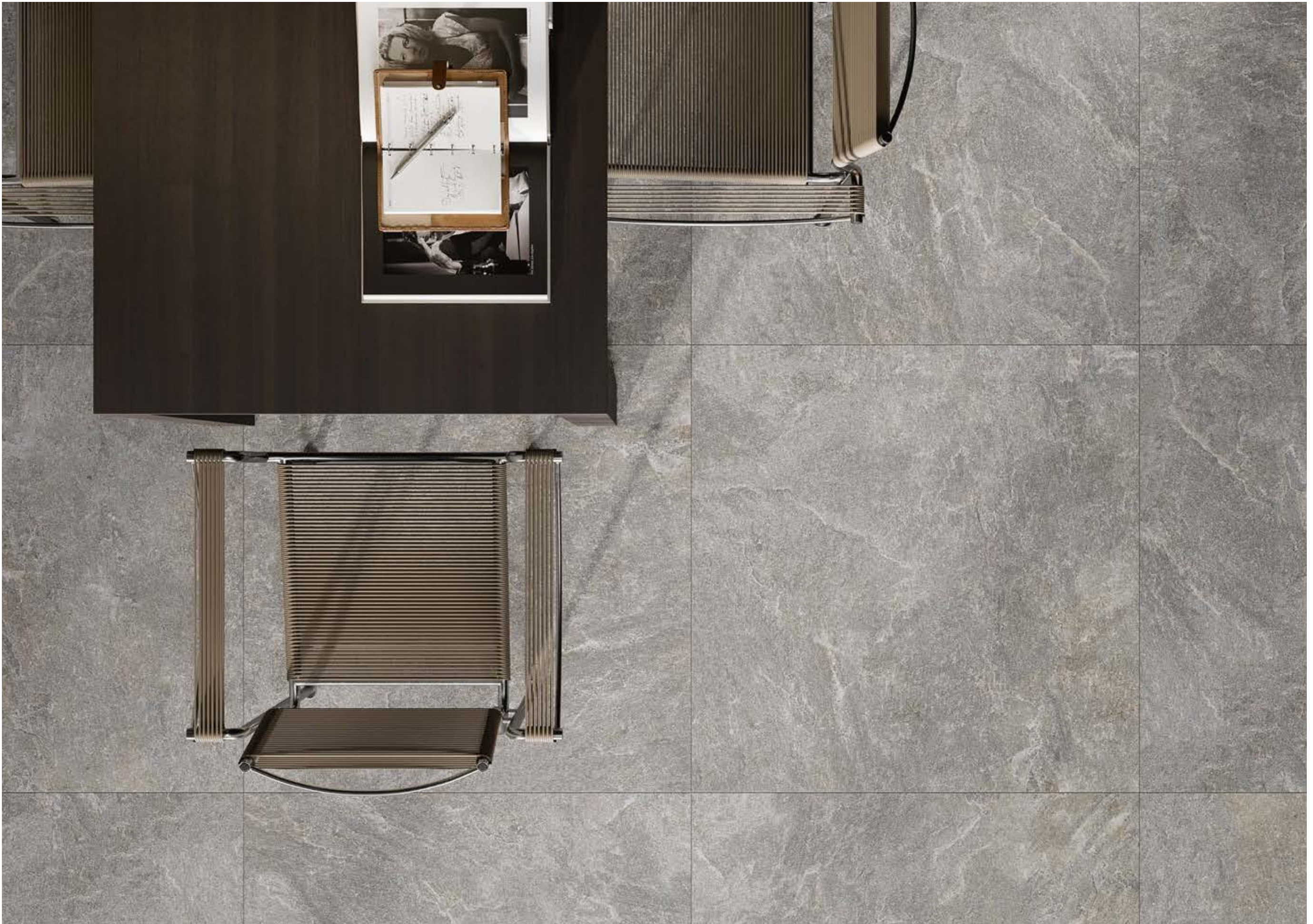
Collection: Solid Stone | Color: Solid Stone Grey