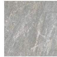
Solid Stone Grey