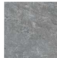
Solid Stone Anthracite