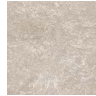
Solid Stone Beige