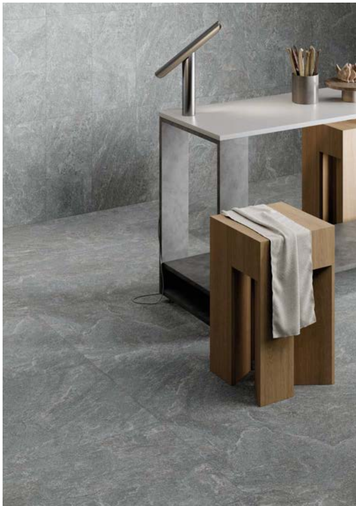
Collection: Solid Stone | Color: Solid Stone Anthracite Collection: Urban | Color: Urban Dove