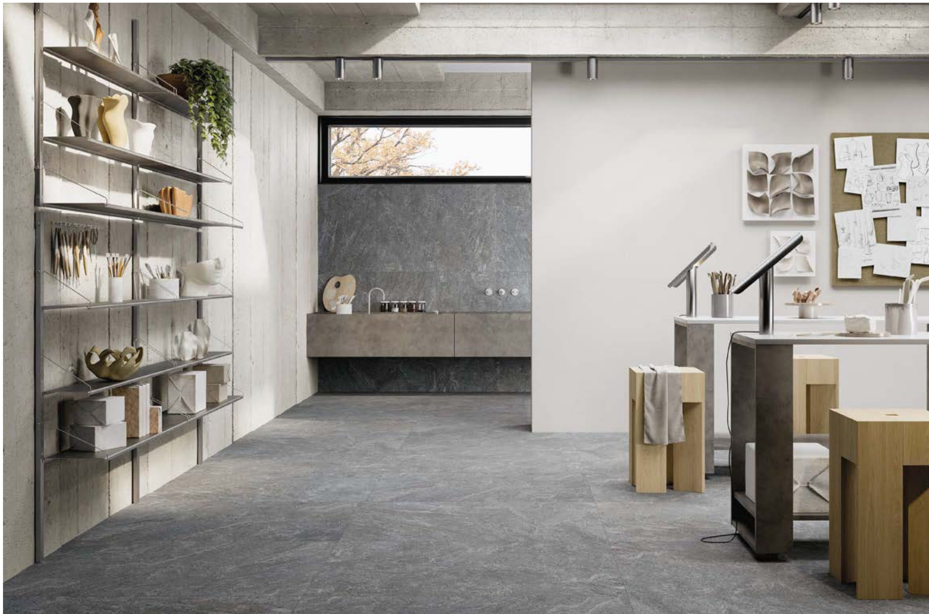
Collection: Solid Stone | Color: Solid Stone Anthracite Collection: Urban | Color: Urban Dove