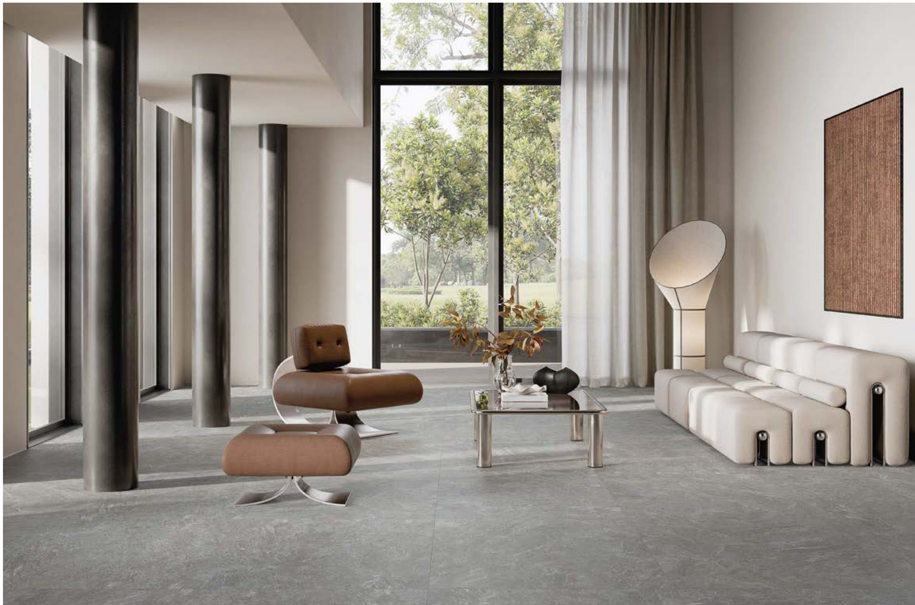
Collection: Solid Stone | Color: Solid Stone Grey