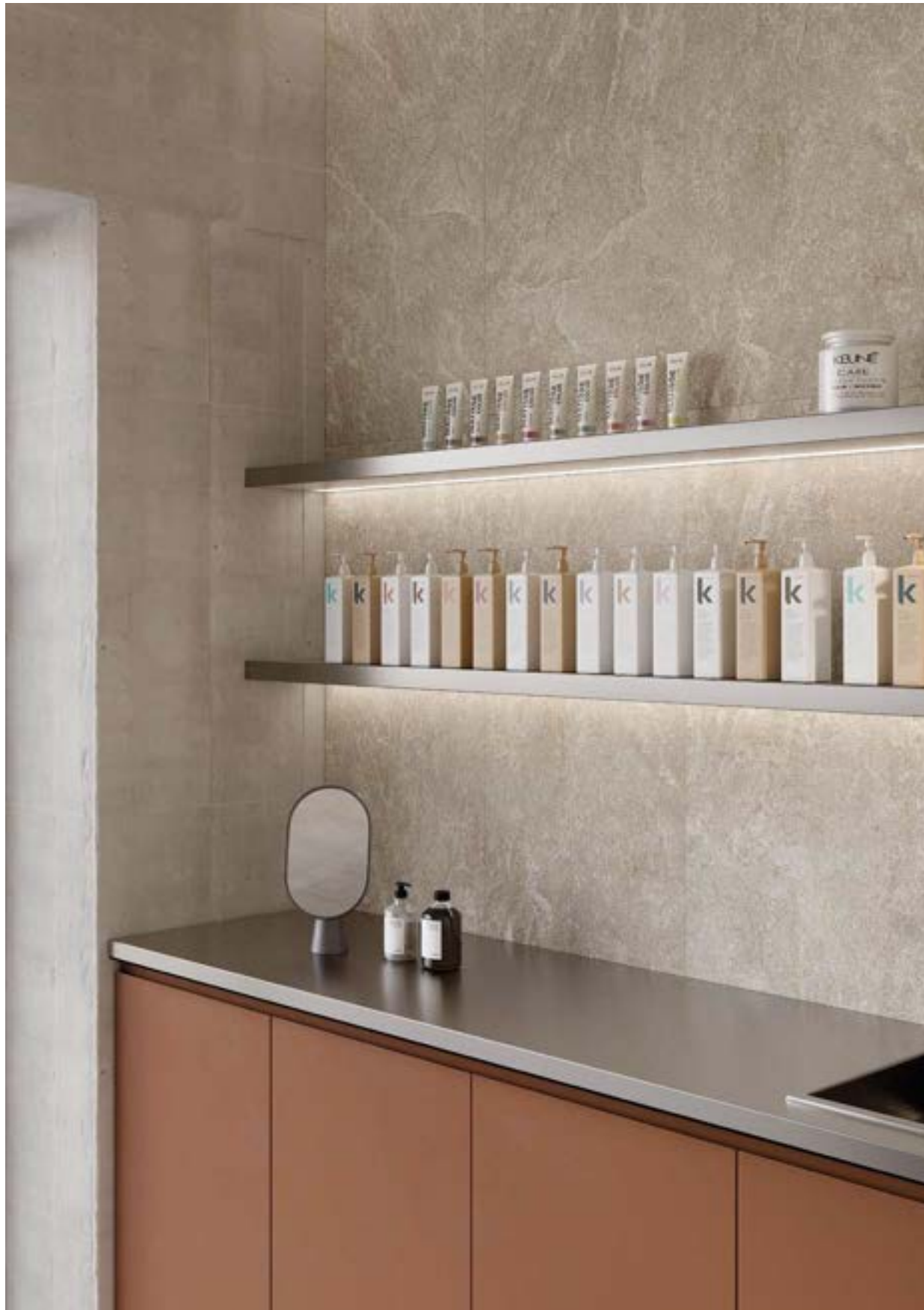
Collection: Solid Stone | Colors: Solid Stone Beige, Solid Stone Brown