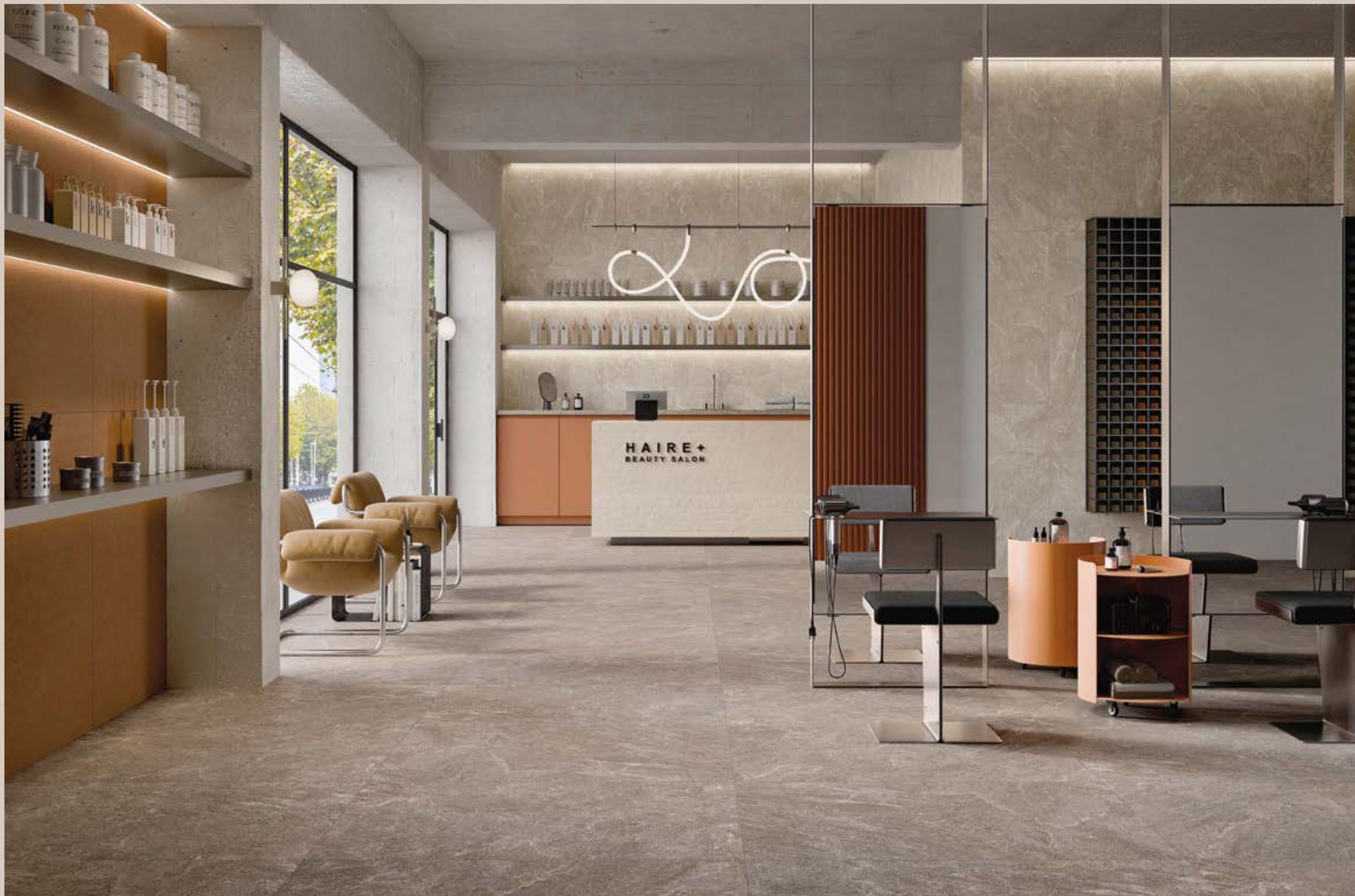
Collection: Solid Stone | Colors: Solid Stone Brown, Solid Stone Beige