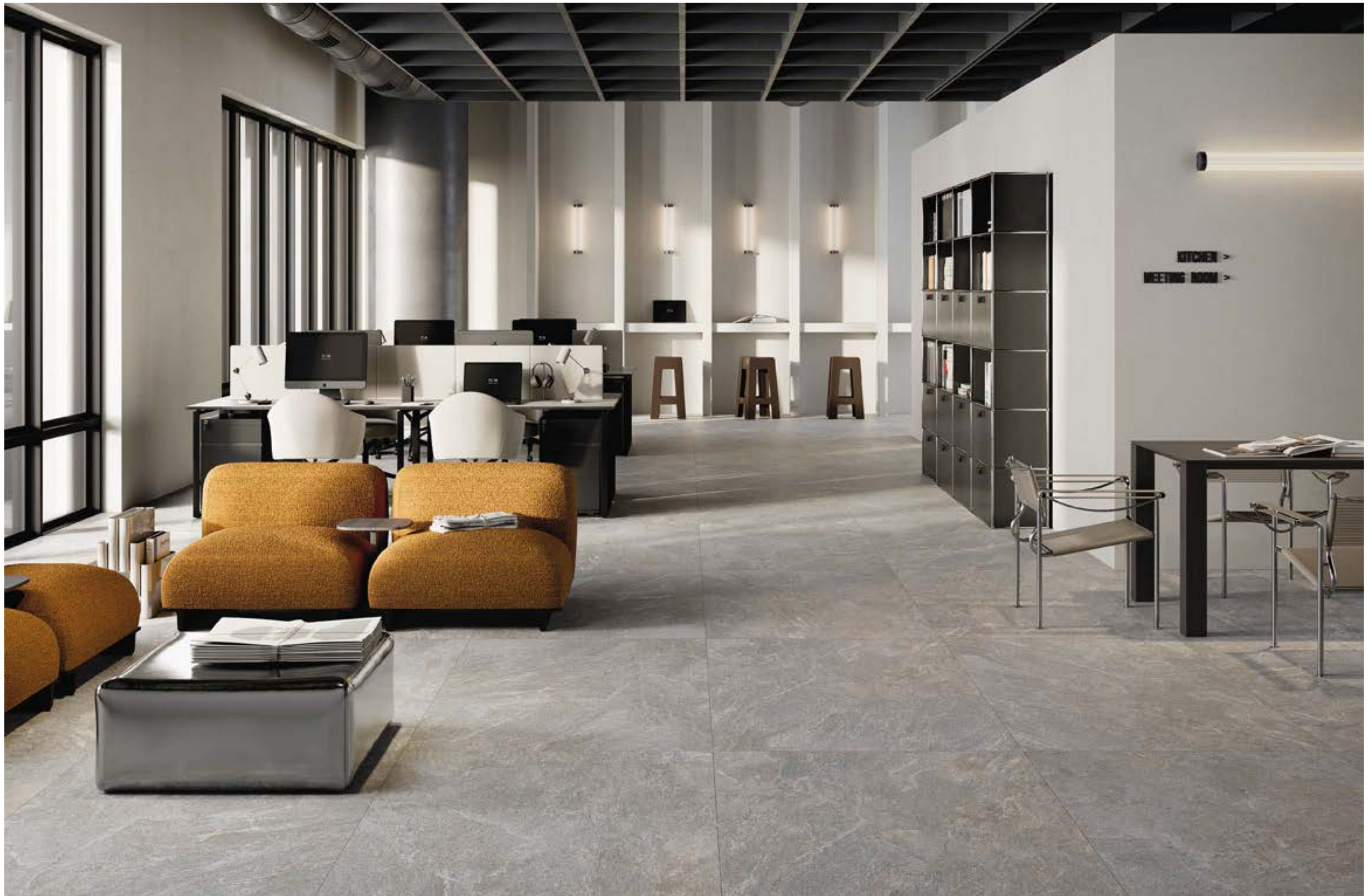
Collection: Solid Stone | Color: Solid Stone Grey